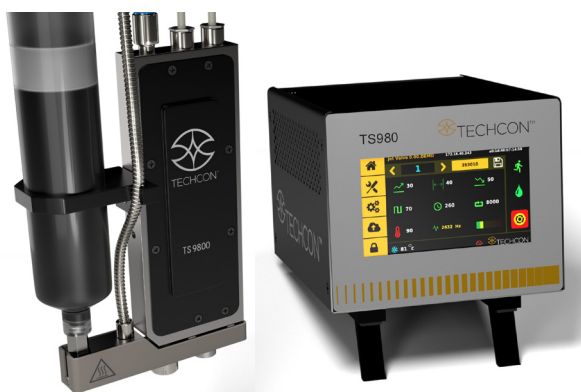
Techcon TS9800 Series Jet Valve

Currently several manufacturers provide piezo jet valve dispensing solutions, and, as one would expect, a number of aspects of their design as related to both the valve itself and the related controller can differ significantly.